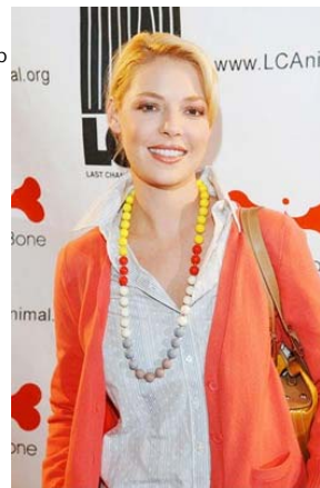
Photo right: Katherine Heigl sporting a burnt orange cardigan at the grand opening of the new pet store, OrangeBone™, in Los Angeles.

The fruit, which is indeed the source of the color's name, was originally known as "naranja," a Sanskrit word. This sweet and flavorful delicacy was first grown in India, gaining popularity in the Western world during the sea-trading heydays of the Roman Empire. Then, it was particularly popular amongst the well-to-do military class. The color — and the flavor — were a hit and as citrus orchards spread throughout the world so, too, did the accessibility and popularity of the orange.